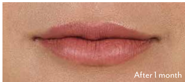
After 1 month

Ask us how you can get subtle, long-lasting results with JUVÉDERM VOLBELLA® XC.