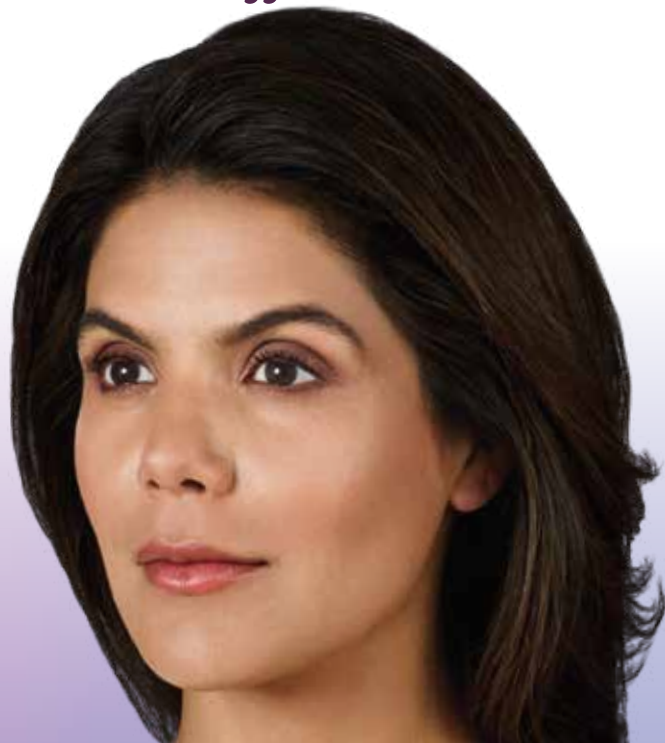
After 1 month